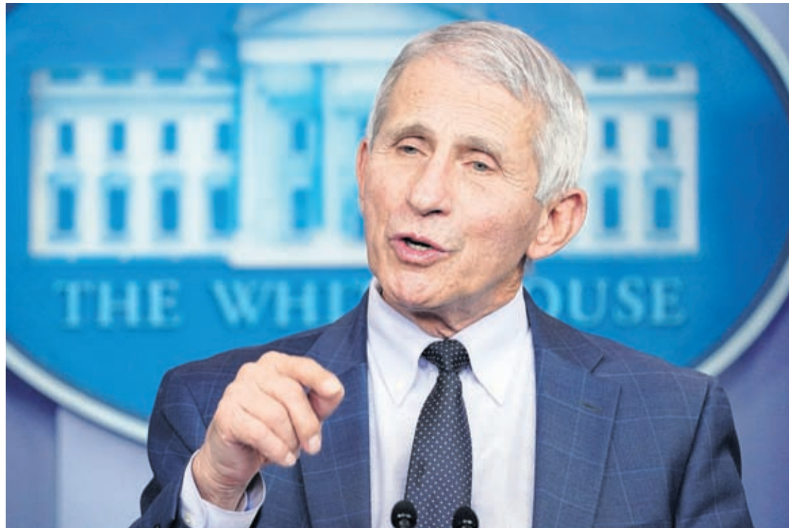
Dr. Anthony Fauci, director of the National Institute of Allergy and Infectious Diseases, speaks during the daily briefing at the White House in Washington, Wednesday, Dec. 1, 2021.

Fauci, director of the National Institute of Allergy and Infectious Diseases, tried to defend the president's earlier promise in a separate interview Sunday